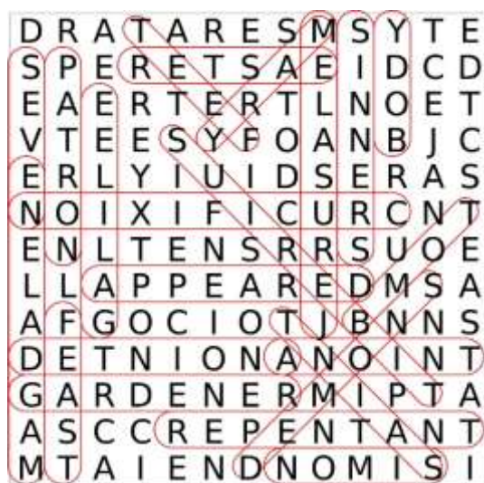
Last edition's solution

The vicar was already regretting ordering the new stained-glass window from IKEA